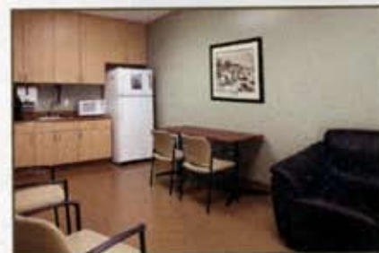
Rest and relaxation: Dr. Wheaton gave team members plenty of space to kick back and unwind in the break room.