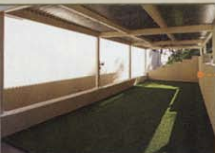
Potty porch: An outdoor pet relief area minimizes inside messes.