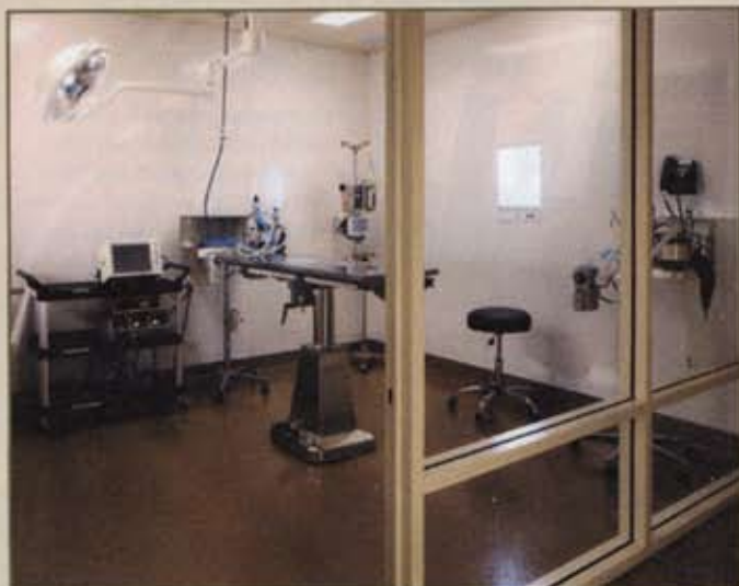
Surgery: The surgical suite's location just off the treatment area creates a "cohesive hospital environment," Dr. Wheaton says.