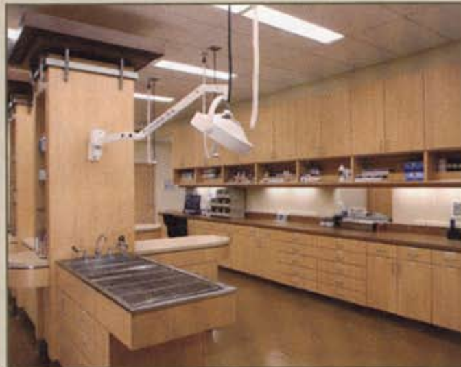
Hub of the hospital: The treatment area was designed as a centrally accessible and strategic visual control point for its related functions.