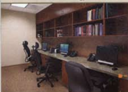
A space to work: Dark wood shelves highlight the doctors' office.