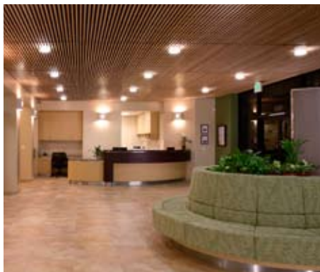
Alicia Pet Care Center (Mission Viejo, CA) 6,000 SF tenant improvement general practice.