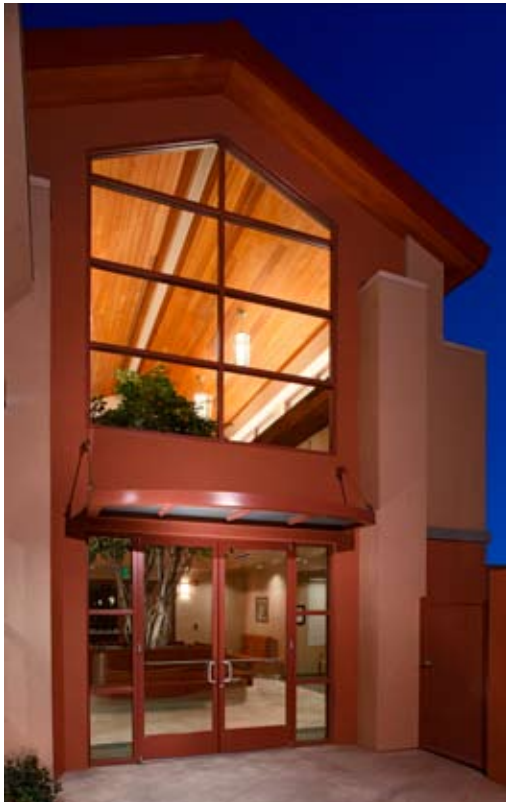
Bakersfield Veterinary Hospital (Bakersfield, CA) 13,570 SF general practice which also includes specialty, referral and emergency clinic plus luxury and general boarding.